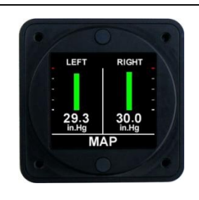
Dual manifold pressure systems with optional voltmeter

This document set is applicable to the following part number configurations: