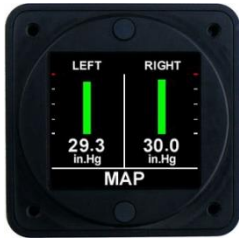
Dual manifold pressure systems with optional voltmeter

This document set is applicable to the following part number configurations: